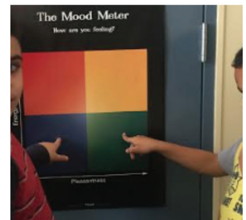
Students checking in on the mood meter before solving a problem.

RULER is not a curriculum, it is an approach. The RULER approach is modeled by adults and implemented within our existing curricula. It is woven into the fabric of daily school life. It is not an add-on.