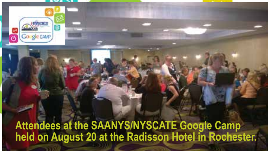
Attendees at the SAANYS/NYSCATE Google Camp held on August 20 at the Radisson Hotel in Rochester.