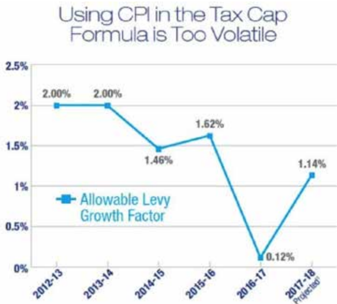
1 Change in Consumer Price Index, Monthly average for Jan.-Oct. 2015 vs. Jan.-Oct. 2016

The 2 percent tax cap has not been 2 percent for the last four years (see graph below). This year's cap is set at 1.26 percent. The property tax cap is based on the lower of 2 percent or the Consumer Price Index (CPI). The CPI is based on the average cost of items such as food, clothing, shelter, fuel, transportation fares, and charges for doctor and dentist services, and many other costs that are bundled together to provide an average percent.